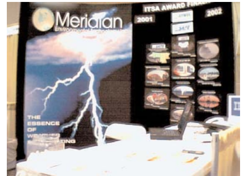
Meridian brought a booth that displayed their advanced weather forecasting systems.