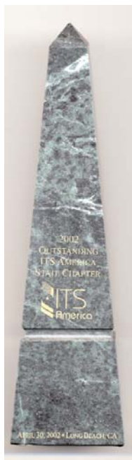
ITS Heartland's "2002 Chapter of the Year" award presented at the ITSA annual meeting on April 30.