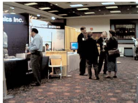
Thirty-eight vendors attended this year's meeting.