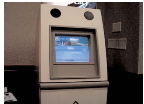
The City of Sioux City, Iowa, brought their transit kiosk for attendees to view.