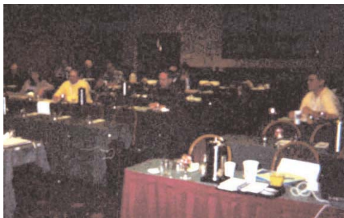
ITS Heartland board members convene at the Annual Meeting in Des Moines, Iowa to discuss Chapter business as well as discuss upcoming events for the chapter.