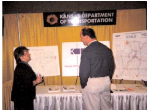
The Kansas Department of Transportation was one of the public sector clients attending.