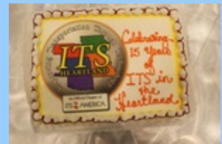
Celebrating 15 years of ITS in the Heartland!

ITSA Vehicle-to-Infrastructure Deployment Coalition -- ITS America held a webinar to inform of the V2I Deployment Coalition. Archived Webinar!